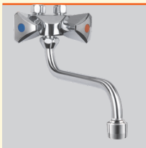
Quality mixing tap