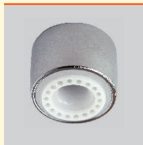
Savings on water and energy up to 50% with the use of fine stream spray head