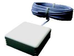
KTS5 extern temperature sensor range -55°C - 90°C cable lenght 12m, max 100m wall mount enclosure