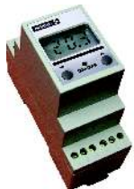
UNITHERM E2, E3 DIN Rail mount thermostat user code for keyboard lock and for user selectable temperature range