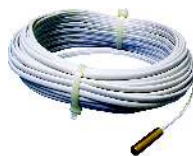
KTS4 extern temperature sensor range -55°C - 125°C cable lenght 12m, max 100m water resistant housing