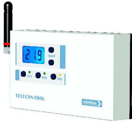
GSM MODELS (REQUIRE STANDARD SIM CARD)