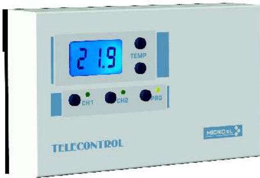
FIXED PHONE LINE MODELS (REQUIRE FIXED PHONE LINE)