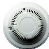
natural gas detector