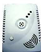
carbon monoxide detector